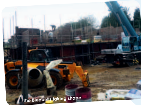
The Bluebells taking shape

We anticipate it will cost £130,000 per annum to cover the running costs of The Bluebells. This will give 100 seriously ill children and their families the chance to enjoy a holiday at The Bluebells with a further 500 being able to use it's leisure facilities on single day visits. We are looking for 52 sponsors, each pledging £2,500 per annum for an initial two year period. If you know of a company, organisation or individual that might consider becoming a Bluebells sponsor please contact Jane or Sue with details so that we can follow up with an approach.