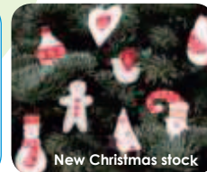
New Christmas stock